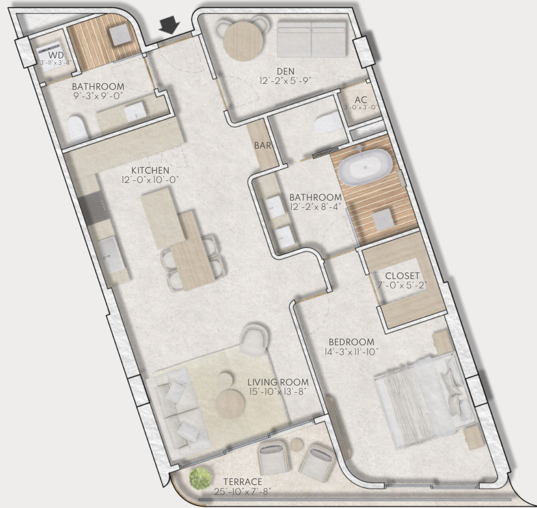
↓ SOUTH-EAST VIEW